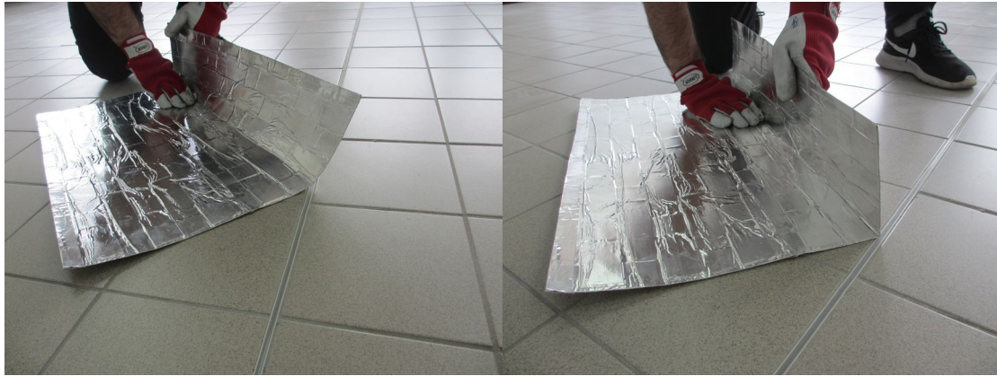
Pictures 9-10: Bending a strip of G-iron ArmoFlex® to form an angular part

Follow the same procedure as that required for the strip. Once the strip has been properly taped, it has to be bent by hand at the measured bending point indicated in our executive project (see pic. 9 & 10).